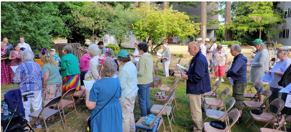
Mass on the Grass 2022

Plans for the church began in 1959. St. Aidan's became a full parish in 1967, eventually locating on our four acres of beautiful, wooded greenery. Since inception, St. Aidan's has prevailed through time as a spiritual home for generations of families and individuals from all walks of life. St. Aidan's committed congregation actively serves as