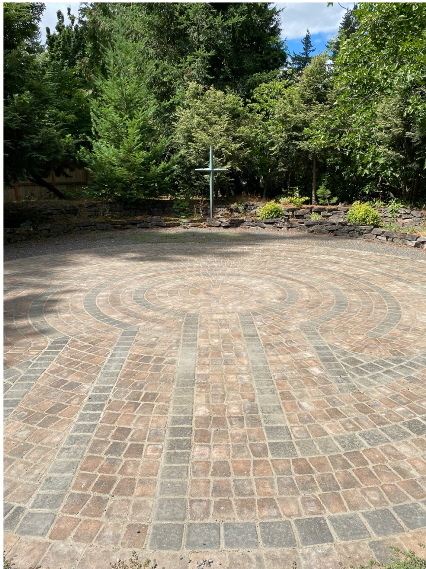
The Esme J.R. Culver Garden Labyrinth

Finally, a priest with a good sense of humor – including the ability to see the humor in one’s own foibles – will be most welcome. We are looking for a priest with respect and appreciation for the gifts of each person, a desire to learn from us, and a compassionate heart as we journey together into a shared future.