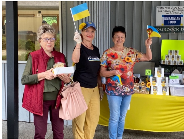
St. Aidan's Day, 2022, Eastside Day Care