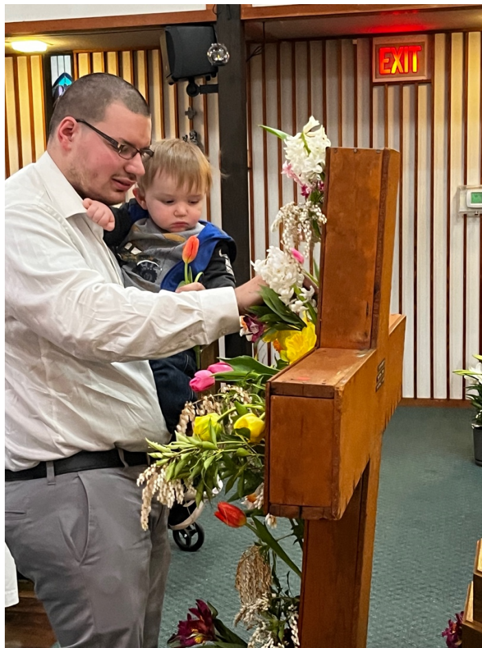
Easter Sunday, 2023 Flowering of the Cross