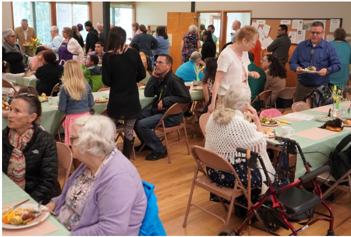
Coffee hour at St. Aidan's.

St. Aidan's is an unusually warm and welcoming community. Many in our congregation share stories of how they chose St. Aidan's as their church home. They remark on how genuine and accepting people are in engaging visitors. Our Sunday services are followed by a coffee hour hosted by