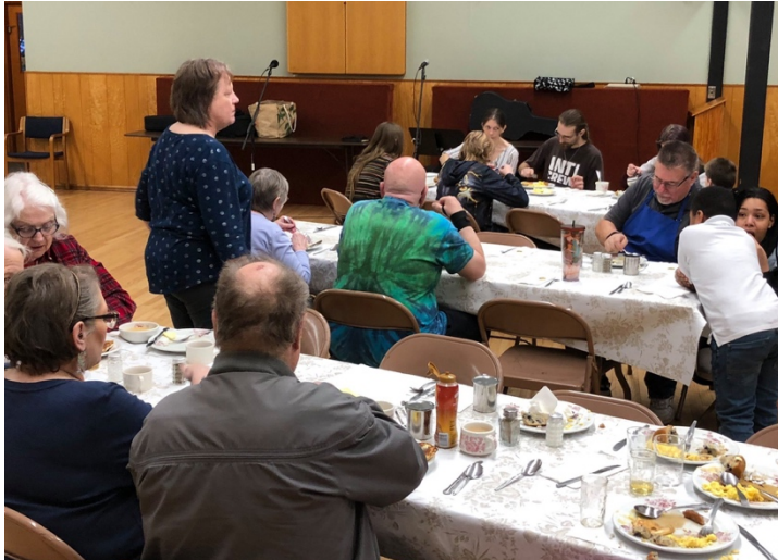
Community dinner 2019

and those who can troubleshoot electrical and plumbing systems complete minor repairs. When we purchased a second-hand Schlicker organ last year, the entire move and installation was made by volunteers requiring only one professional consultant. It is worth noting that all parish activities, except for the Director of Music and two part-time Sextons, are contributions of our members.