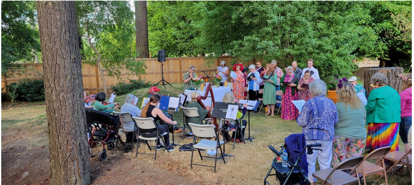
Choir and musicians 2022 Mass on the Grass.

added immeasurably to our worship services. As a result, congregational singing has significantly increased. Several members of the congregation also play instruments, adding to our musical worship. Other volunteer singers and instrumentalists are recruited externally to share their talents for special services. Plans are currently being developed to provide concerts for the community.