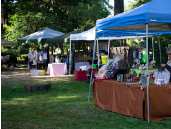
St. Aidan's Day Festival, 2019